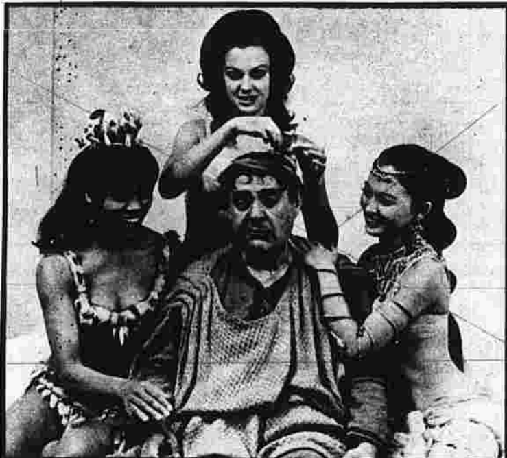
Zero Mostel seemingly ignores favors of bevy of beauties in movie, "Way to the Forum," July 27.