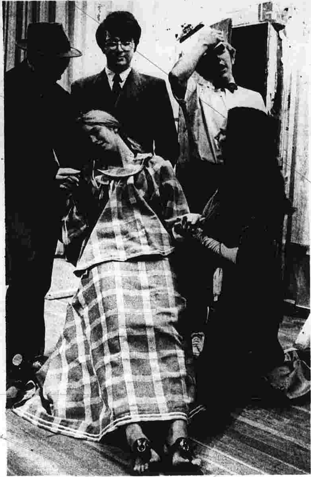
A Play on Problems of Staging Play