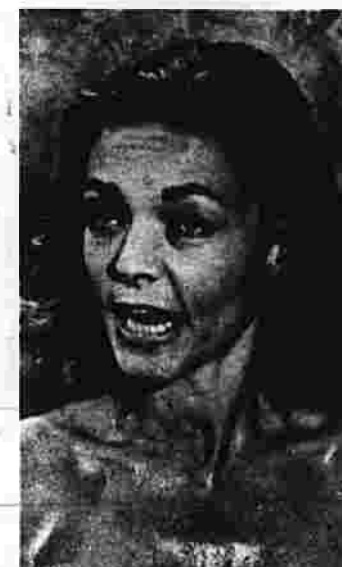
Lauren Bacall plays twin sisters on "Adventure Theater" July 31 on NBC.

MORNING PROGRAMS 5:50 (3) Sign On and Prayer (C) 5:55 (3) Town Crier (C) 6:00 (3) Summer Semester (C) (20) Golden Years (C) 6:10 (3) Newscope (C) 6:15 (3) Perspectives (C) 6:20 (3) Congressional Report (C) (20) Consultation (C) 6:45 (3) A New Day (C) 6:50 (23) Weather (C) 7:00 (3) News (C) (5) Mr. Goober (C) (23-30) Today Show (C) 7:55 (40) Heritage Corner (C) 8:00 (3) Capt. Kangaroo (C) (40) Strum 'N' Drummers (C) Mon. only: Apollo Flight to 8:10 9:00 (3) Hap Richards Show (C) (3) Clisco Kid (C) (23-30) Mon. only: Apollo 15 Liftoff of moon rocket is scheduled for 9:58 a.m. (23) David Frost Show (C) (30) Galloping Gourmet (C) (40) Finlandia (C) 9:15 (3) Yogi Bear Show (C) 9:30 (3) Lucy Show (C) (3) Phil Donahue Show (C) (30-40) Mon. only: Apollo 15 (30) News (C) (40) Leave It to Beaver (C) 10:00 (3) Movie (23-30) Dinah's Place (C) (40) What's My Line? (C) 10:30 (3) Cona-Tact (C) (23-30) Concentration (C) (40) Jack LaLanne Show (C) (23-30) Sale of the Century (C) (40) Galloping Gourmet (C) 11:30 (3) Love of Life (C) (8-40) That Girl (C) (23-30) Hollywood Squares (C) 12:00 (3) Twelve O'Clock Report (C) (8-40) Bewitched (C) (23-30) Jeopardy (C) 12:25 (3) News (C) 12:30 (3) Search for Tomorrow (C) (8-40) Love, American Style (C) (23-30) The Who, What or Where Game (C) 12:55 (23-30) News (C)